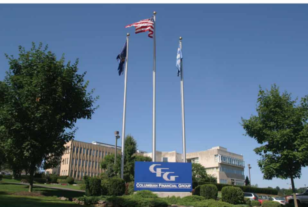
Corporate Headquarters, Binghamton, NY

Columbian has a rich history in the life insurance business. Columbian Mutual Life has been selling policies to provide for our customers' insurance needs for over 125 years. The Columbian Financial Group of companies, which includes Columbian Mutual Life Insurance Company, Columbian Life Insurance Company, and other affiliated companies within our corporate family is built on a foundation of value and service with a standard of dependability you can trust. Our Company has always prided itself on maintaining a solid financial and investment posture to ensure policyholder obligations are met. We offer consumer-oriented products designed for family and business life insurance needs, and provide prompt, accurate and friendly service to our clients.